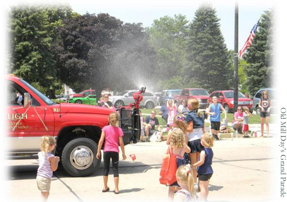
Old Mill Day's Grand Parade

Neligh really is “Not too Small to Have it All!” It is a community that has a great foundation. However, if Neligh is to remain a prosperous regional hub, maintain its current business stock, and encourage investment, Neligh must work to enhance certain elements of the community. NEDO must work to augment Neligh’s quality of life, its business climate, and culture to ensure it is prosperous for decades to come. Developing a Business Retention and Expansion program will work to enhance Neligh’s current business stock as well as identifying business needs that NEDO might be able to address. The Neligh Economic Development Office will work to enhance the labor pool available to Neligh’s employers. Workforce Development is critical to the success of Neligh as a place to do business. Workforce Development is more than ensuring a pool of warm bodies is available to fill positions. Rather it is making certain that those potential employees have access to training and development tools that will enhance the operations of their future employer. Youth Retention will serve to enhance Neligh’s labor pool with employees that are acquainted with Neligh and will be more likely to be long-term employees worth investing in.