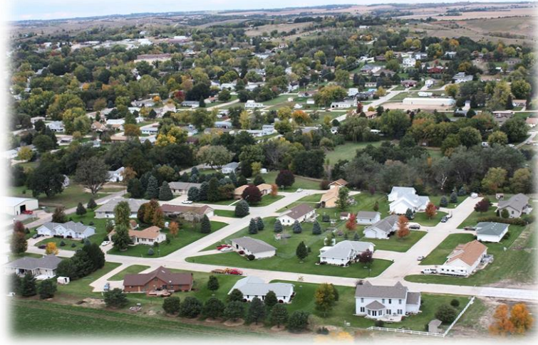
Aerial View of Neligh from the South

years, NEDO will partner with the City Council to develop new incentives that might help attract new businesses to Neligh.