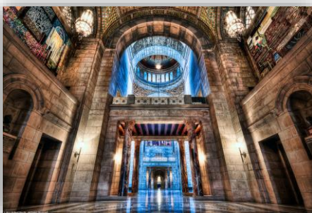
Nebraska Capital Building

Lobbying: The Neligh Economic Development Office is responsible for lobbying for the City of Neligh in matters that will affect the municipality or business community. Collective lobbying has proven time and time again to be effective. For that reason, NEDO will utilize three State-wide partnerships to augment its lobbying abilities. The Nebraska Economic Developer’s Association (NEDA) holds a lobbying day in which economic development professionals from across the state join forces to look at proposed and current legislation that might have an impact on economic development. NEDO will keep a close eye on updates from NEDA’s Legislative Committee and take action when necessary. The League of Nebraska Municipalities (LNM) publishes a weekly newsletter which keeps member communities abreast of legislative issues that might affect municipalities.