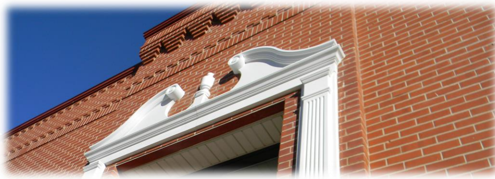
Heritage Bank entrance

Business Transition: While NEDO’s resources are limited, it does serve as the initial point of contact for those looking to expand, move to, or invest in Neligh. For that reason, NEDO will offer its assistance to businesses looking to transition to new ownership. NEDO will help advertise on its website and will attempt to identify individuals who might be a perfect fit for business ownership.