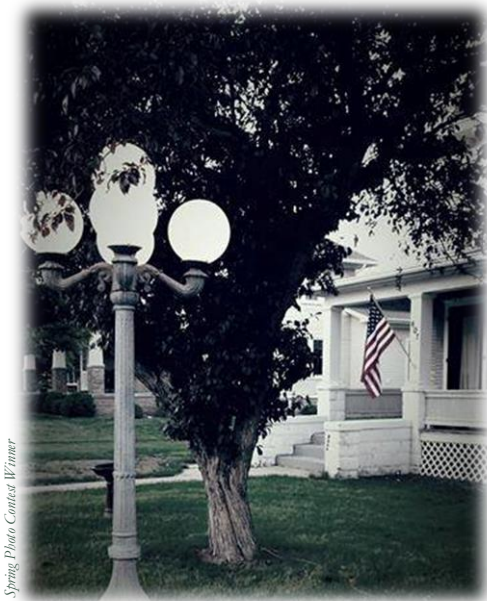
Spring Photo Contest Winner

along U.S. Highway 275 which carries a significant amount of traffic. Community marketing has not been used to its full