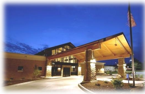
Antelope Memorial Hospital