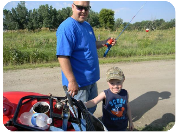
Old Mill Days Kids Fishing Derby

Quality of Life Showcase Grant: The Neligh Economic Development Office takes a holistic approach to economic development. The Quality of Life Showcase Grant is a unique and innovative approach to marketing Neligh in order to attract new workforce. The Quality of Life Showcase Grant offers financial assistance to events and programs that positively showcase the quality of life in Neligh. A total of $1,000 in grant funding is offered annually with a maximum grant amount of $500. The funding ensures that these events showcase Neligh in a positive light.