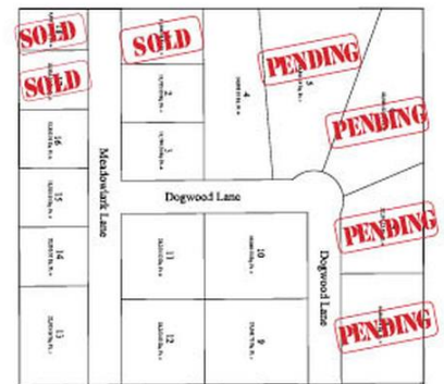
Countryside Acres Second Addition Lot Map

Housing Beautification: The citizens of Neligh have voiced their concern for some sort of housing beautification effort through several mediums. NEDO will look to develop some form of a Housing Beautification program whether it be a Beautification Incentive, coordinating a volunteer effort, or encouraging the enforcement/extension of current nuisance ordinances.