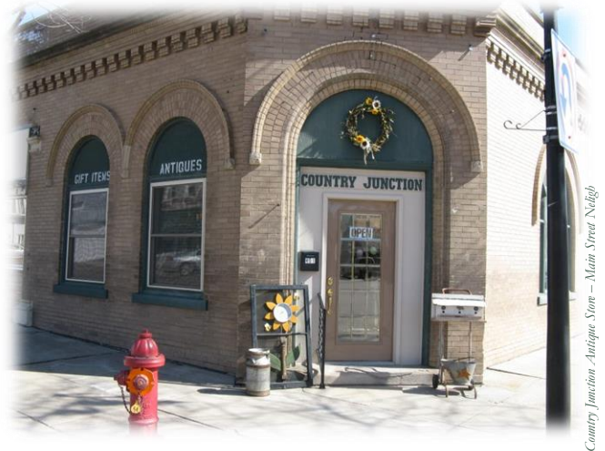
Country Junction Antiques Store – Main Street Neligh

Expansion Incentives: Neligh recently conducted a Blight and Substandard Study in which 26% of Neligh was designated Blighted see ATTACHMENT B for a map. This gives the City of Neligh the option to offer Tax Increment Finance (TIF) funds to developers looking to redevelop the blighted area. TIF is a commonly used economic development tool which pledges the tax increase created by redevelopment to help make the project financially stable. NEDO must develop other expansion incentives if it is to encourage investment in Neligh. Businesses who might do a substantial improvement should have access to expansion incentives such as utility discounts if certain metrics are met. NEDO should spearhead these efforts and work closely with the City Council to identify proper expansion incentives.