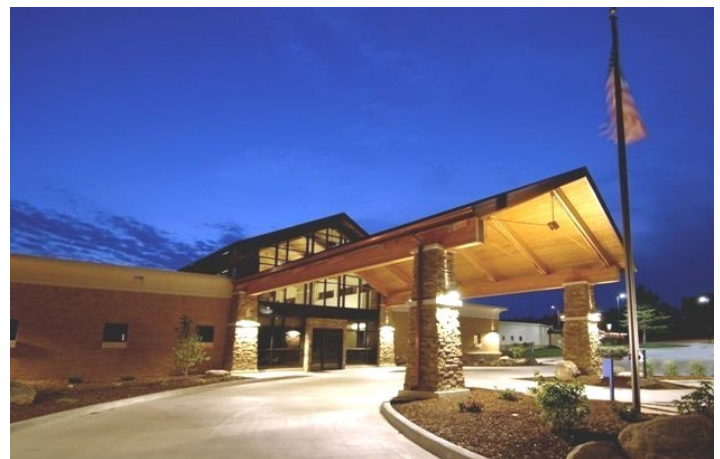
Antelope Memorial Hospital

Neligh is serviced by Antelope Memorial Hospital, a 25 bed critical access hospital which recently underwent a multi million dollar expansion to provide a first class cardiac rehabilitation and physical therapy center. There are two outpatient clinics in the city. Neligh has seven medical practitioners, one dentist, one optometrist, seventy-three nurses, and two nurse anesthetists.